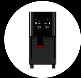
Liquidline Ice Dispenser ICEDISAPI