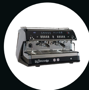
La Spaziale S10 2 Group Traditional Espresso Machine TRADLASPS10G2