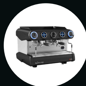
La Spaziale S21 2 Group Traditional Espresso Machine TRADLASPS21G2