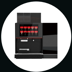
K2FM K2 Bean to Cup Fresh Milk Machine