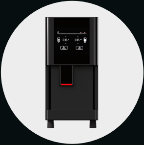
Liquidline Ice Dispenser ICEDISAPI