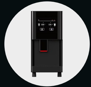
Liquidline Ice Dispenser ICEDISAPI