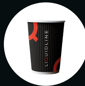
Liquidline Triple Wall 8oz Ripple Cups CBTWRC8