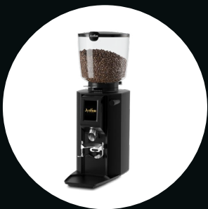
Anfirm Luna Espresso Grinder GRINDANFLUNA