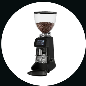
HeyCafe Buddy Espresso Grinder GRINDHEYCB