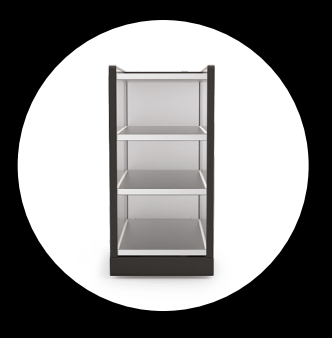
Cup Warmer SCHRCSCWN