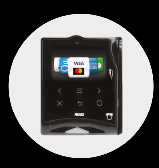
Nayax Contactless Payment System NAYAXCR-TB