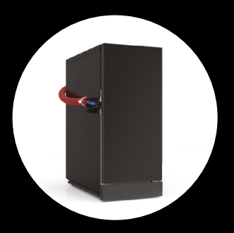
Undercounter Milk Fridge SCHRMF10U-S12T